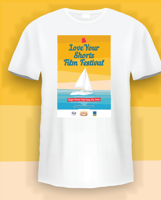
2021 T-shirt - $18 T-shirts from past years - $5 Black polo shirt with LYS logo - $35