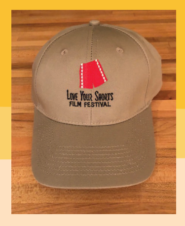
Hat - $15